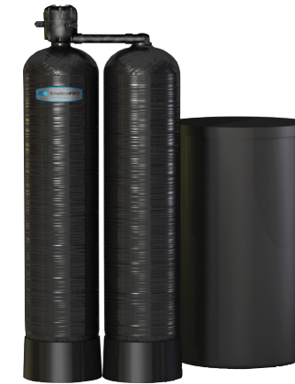
SOFTENERS: CC/ CP SERIES