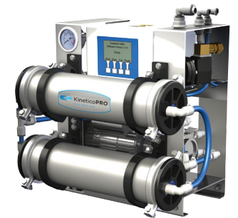
REVERSE OSMOSIS: W/ S-SERIES