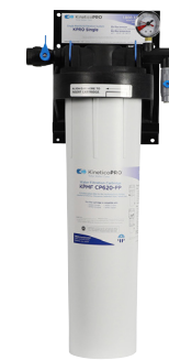
FILTERS: COFFEEPRO SERIES

KineticoPRO has a full suite of innovative water treatment systems designed to help you serve consistent high-quality beverages to your patrons. Our water filters help to reduce scale formation and remove off-tastes and foul odors, while our water softeners and reverse osmosis systems reduce water hardness and total dissolved solids. Helping you maintain recipe compliance, prolong the life of your equipment and reduce costly repairs and undesirable downtime.