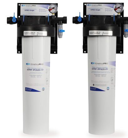
FILTERS ICEPRO IPC/ IPF SERIES

KineticoPRO's IcePRO water filtration and W-Series ROs are specifically designed with ice machines in mind. Our high capacity IcePRO filtration and innovative W-Series RO helps to improve ice clarity, reduce off-tastes and foul odors and prevent damaging scale formation on your ice machines.