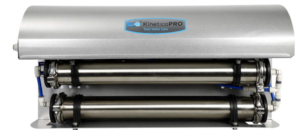
REVERSE OSMOSIS W-SERIES